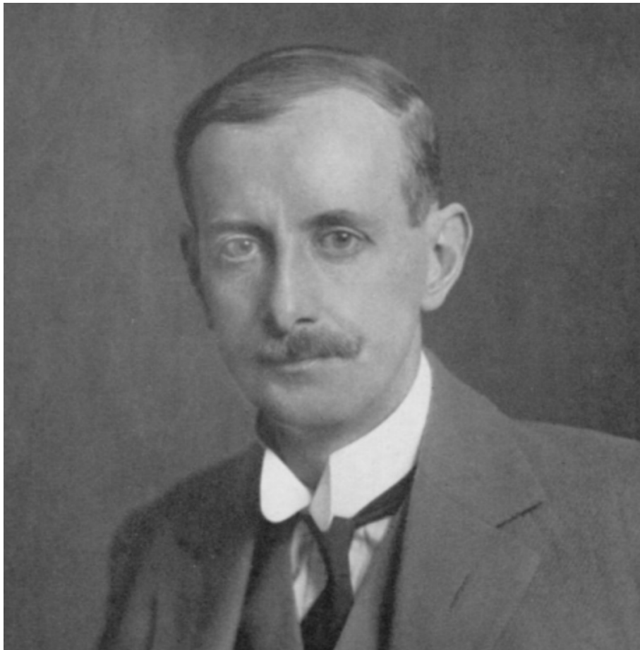
Figure 1: G. N. Watson, with winged collar

edition, but he did not complete it [9, p. 553], [11, p. 256]; after his death, numerous manuscript pages were deposited in the archives of the University of Birmingham.