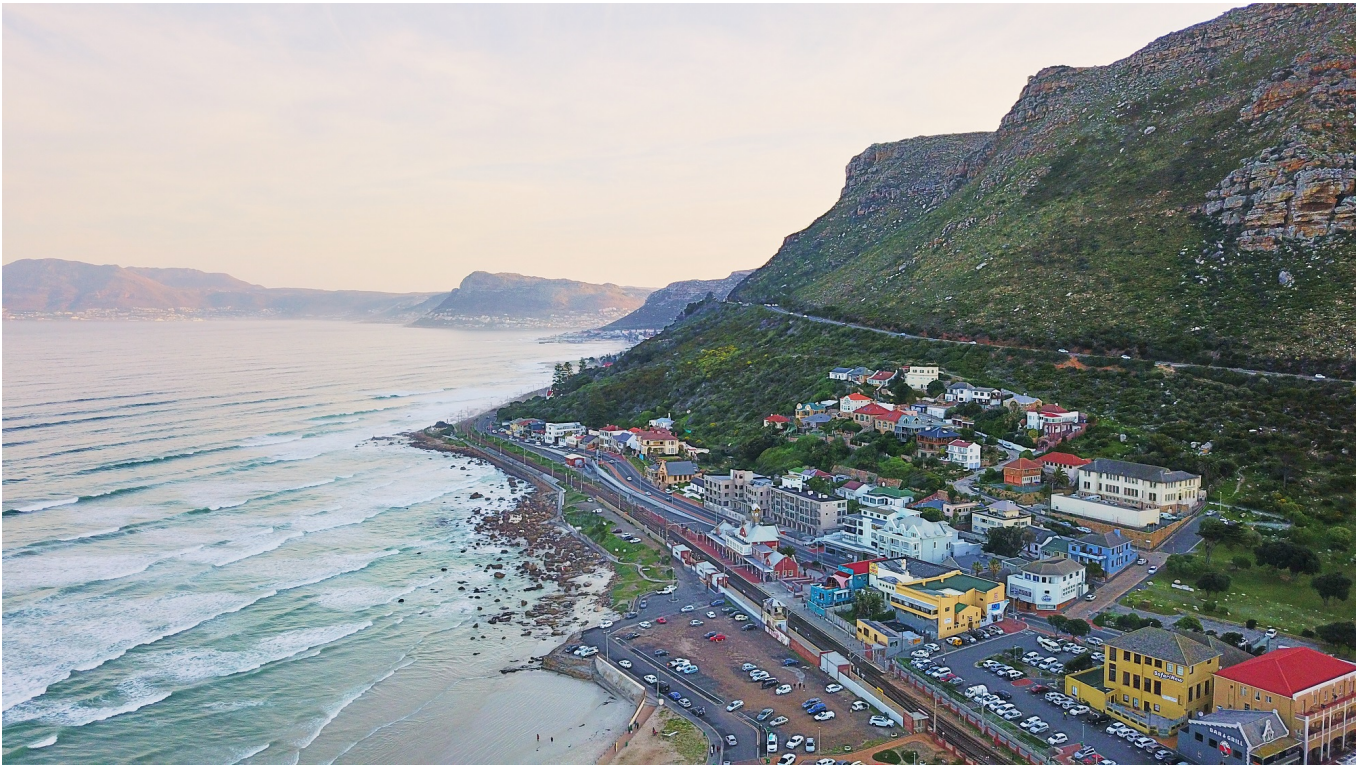
Muizenberg, South Africa

have been studied. For example, rational solutions and special function solutions of Painlevé equations have a close relationship with orthogonal polynomials. From a numerical perspective, reliable and efficient evaluation of solutions of Painlevé equations poses significant challenges, and several approaches have been proposed in the literature, including initial value and boundary value methods in the complex plane and numerical calculation based on the Riemann–Hilbert formulation. Presentations will include survey type lectures on important developments in the area as well as lectures on recent results and open problems.